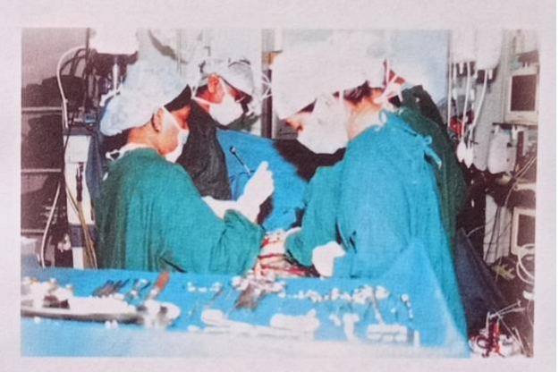
A surgeon performing an operation in an operation theatre

The majority of the people in urban areas are the workers engaged either on the regular employment or on daily wages. These include the workers doing manual work in different industries such as textile industries, pharmaceutical industries, factories, construction industry, etc.