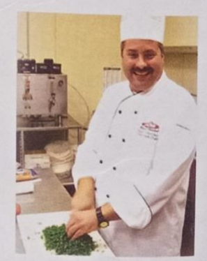
A chef at work

courier services or run the chemist's shop. Also there are restaurants, fast-food joints, jewellery shops and book shops in the local market. There are many people employed as workers in these concerns.